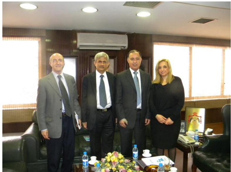
Eng. Mohammad Al -Najjar Minister of Water and Irrigation of Jordan, after receiving the Blue Peace report