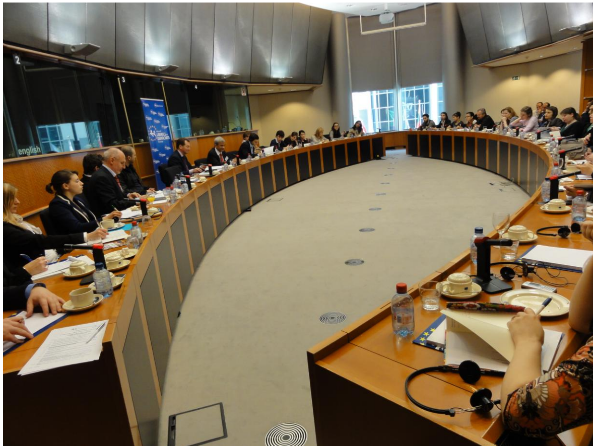
Graham Watson, MEP, Chairs the seminar at the European Parliament