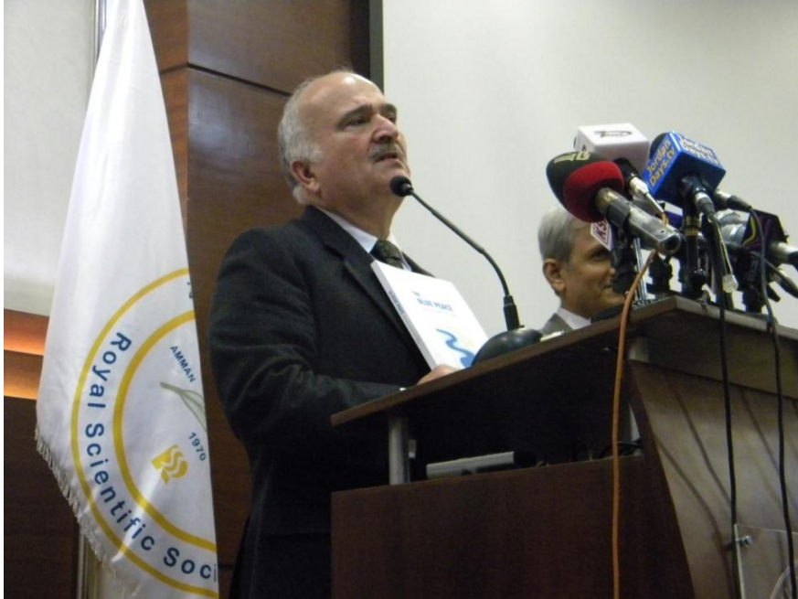
HRH Prince Hassan bin Talal at the Royal Scientific Society, Amman

HRH Prince Hassan bin Talal of Jordan receives the first copy of the report.