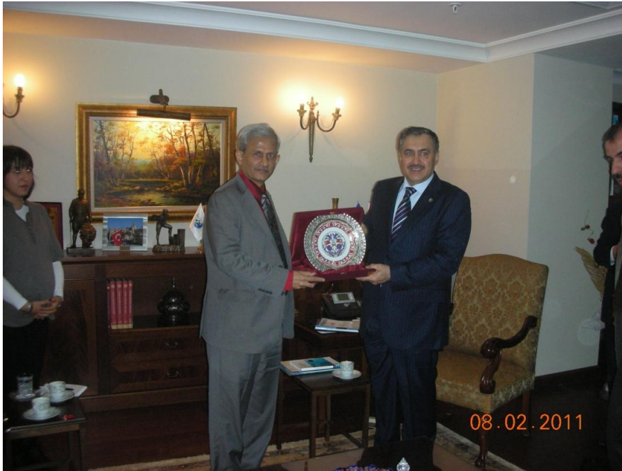
Prof Veysel Eroglu, Minister of Environment and Forests of Turkey