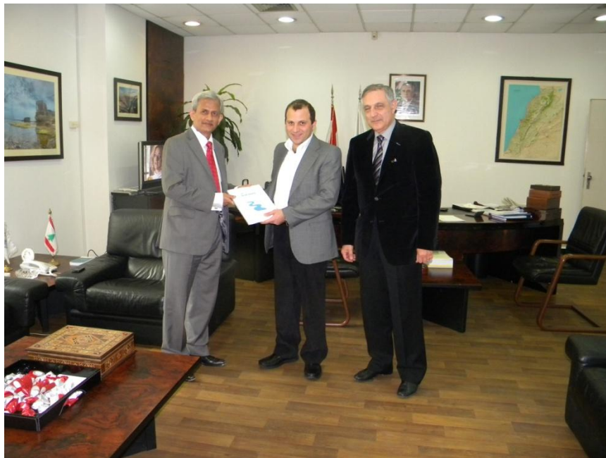
Gibran Bassil, Minister for Water and Energy of Lebanon, receives the report